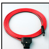
P-TAP 1000 Use with a standard battery P-TAP power source.

The kit INCLUDES AC power supplies. The power adapters below are optional.