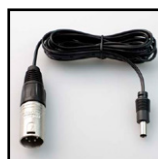
XLR 1000 Use with a standard 4 pin XLR camera battery power source.