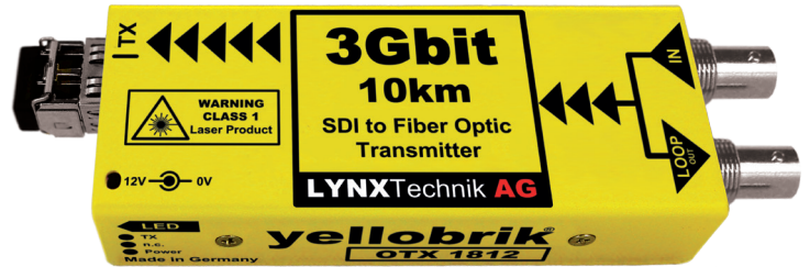
OTX 1812 LC Version Shown